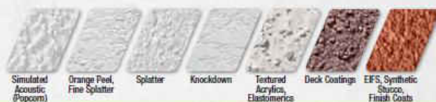
= TexSpray HTX 2030 Complete

TEXTURE APPLICATIONS: Get the interior and exterior texture finish you want with aggregate size up to 2.5 mm.