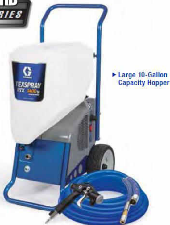
► Large 10-Gallon Capacity Hopper

The RTX Standard Interior Series is the everyday finishing solution designed for the residential and repaint contractor looking for everyday reliability. The features you want with the finish you need.