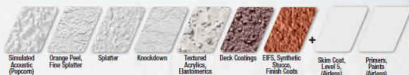
= TexSpray HTX 2030 Complete Plus+