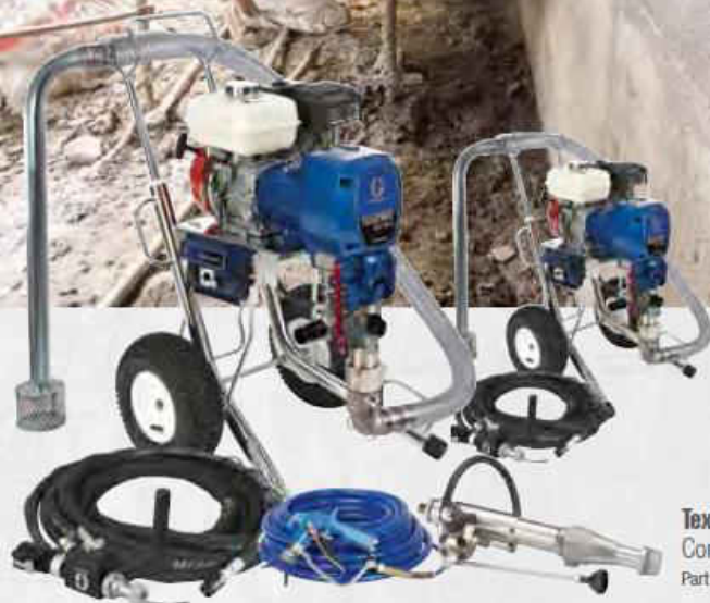
TexSpray HTX 2030 Complete Part #: 258740