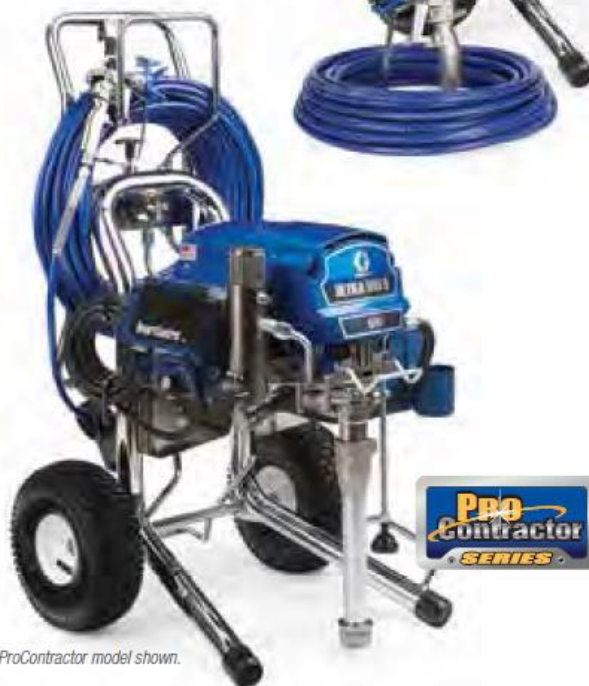
ProContractor model shown.