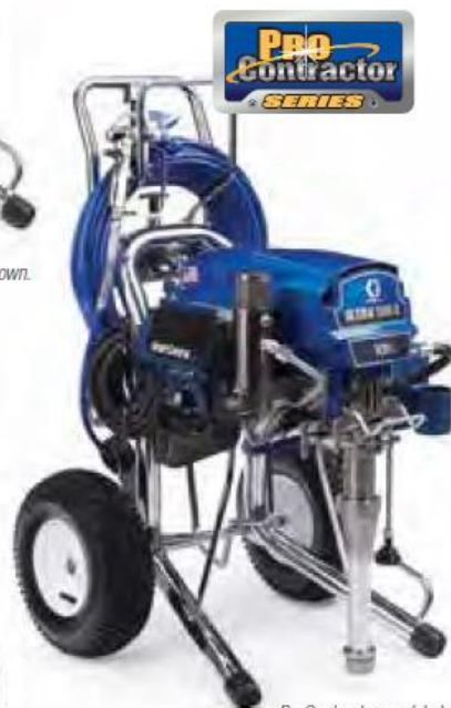
ProContractor model shown.