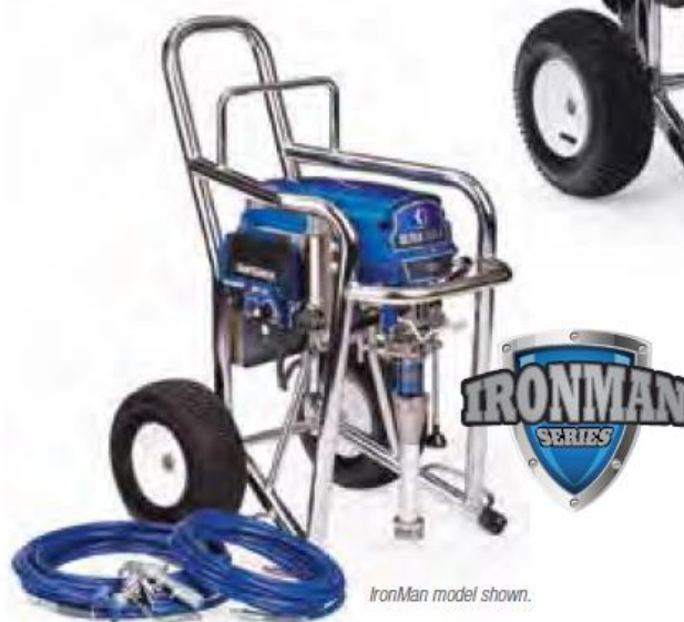
IronMan model shown.