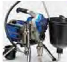
Compatible with 1.5 gallon hopper for small projects.

Lo-Boy has convenient bucket hook to allow easy movement on the job without spilling.