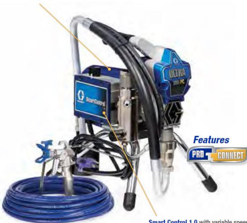
Stand model shown. Lo-Boy and Hi-Boy models also available.

The Ultra 395 PC 's performance and versatility has made it Graco's most popular small electric sprayer. It features SmartControl™ 1.0 pressure control that delivers a consistent spray fan without pressure fluctuation at all spraying pressures. Proven technology and reliability make it perfect for professionals who spray daily with a wide range of coatings.