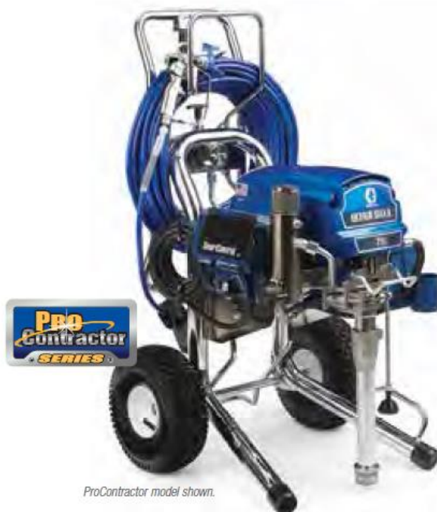
ProContractor model shown.