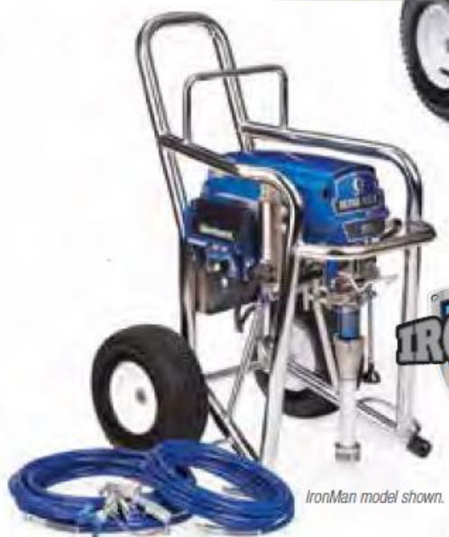
IronMan model shown.