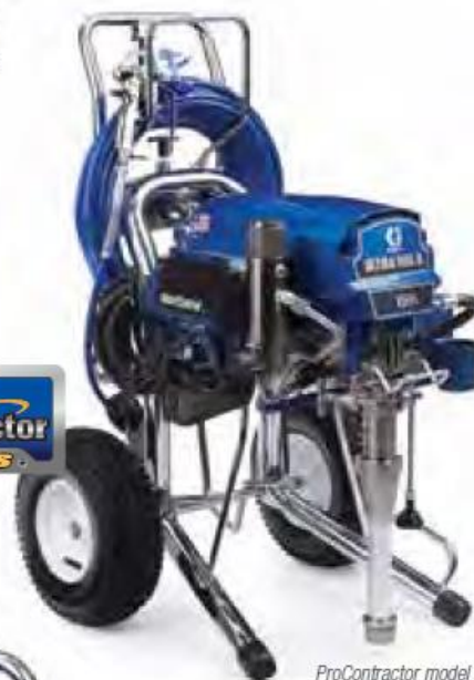
ProContractor model shown.