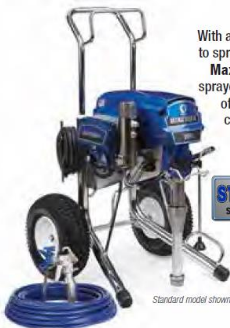
Standard model shown.