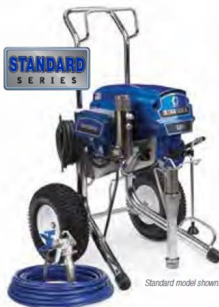
Standard model shown.

With a 2.4 hp brushless DC motor and the ability to spray up to 1.2 gallons per minute, the Ultra Max II 1095 is the industry standard for the large residential and commercial contractor who sprays a wide variety of coatings.