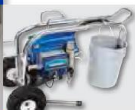
Lo-Boy easily carries a standard 5-gallon paint bucket.