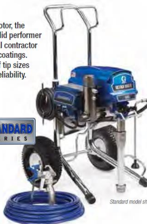
Standard model shown.